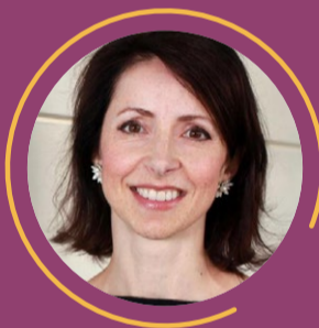
Baroness Helena Morrissey DBE

CEO for Deloitte UK and Managing Partner for People & Purpose for Deloitte North and South Europe